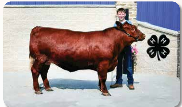
Mason Overberg Reserve Carcass