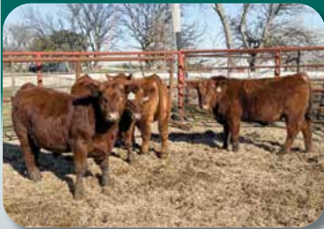
Red Angus Bulls

We are happy to assist you in your bull selections to help you reach your cow herd profitability goals.