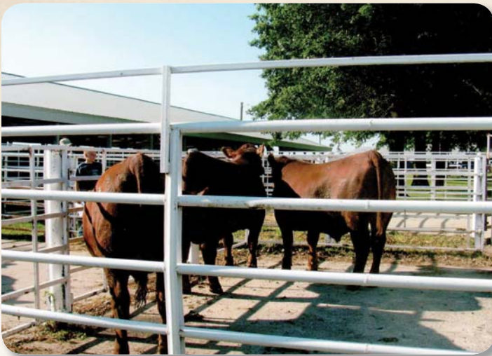
Genevieve Livingston Reserve Champion Lightweight Feeder Pen 2019 Adair Co. Fair Carcass Results One Prime, two Choice Genevieve also had second place Lavender Return Bucket Bottle Calf at the 2019 Adair Co. Fair.